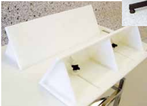
Restraint bench for blood sampling