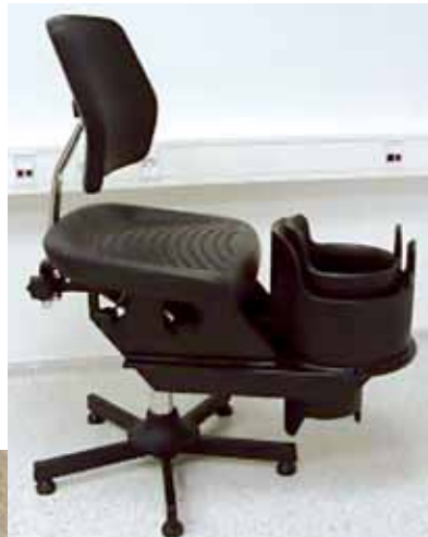
Restraint chair for gavaging