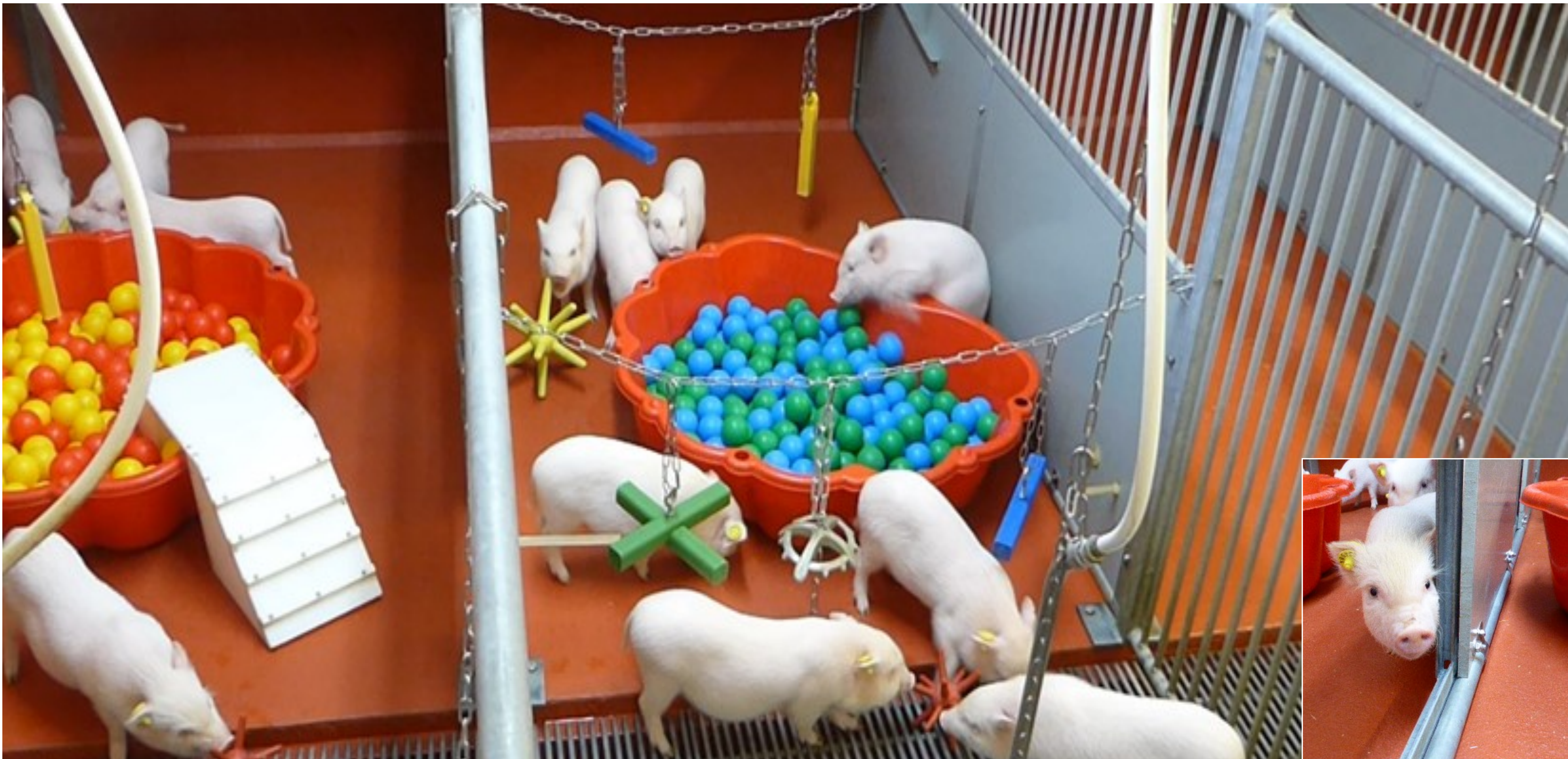
Enrichment room consistent of two adjacent pens with two openings in the pen divider.