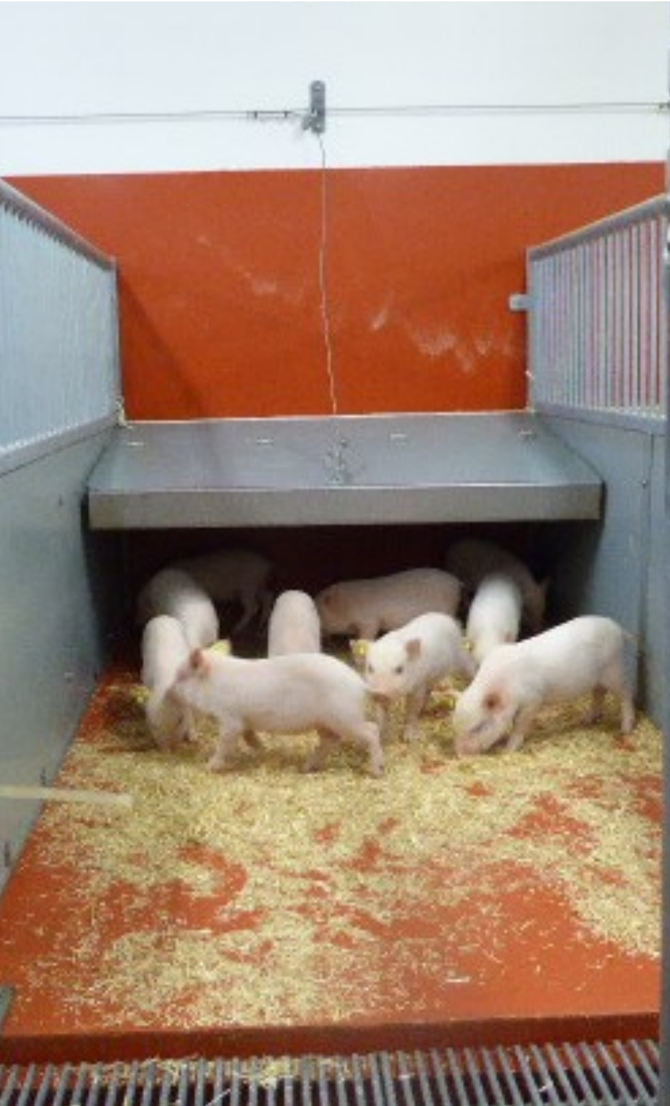
Standard pen at the weaning section

The enrichment room is designed to stimulate Göttingen Minipigs from weaning to 10 weeks of age. This period is a stressful time, as the piglets are separated from the sow, their diet switches from a predominantly milk-based one to one based on solid food and they are often mixed with pigs from other litters in a new environment. These changes can induce behavioral problems such as fighting and belly nosing, tail biting etc. Furthermore, if not exposed to continuous interactions with humans, they can become nervous and stressed during husbandry or study related procedures. A dedicated enrichment pen is therefore of great value for this group of pigs.