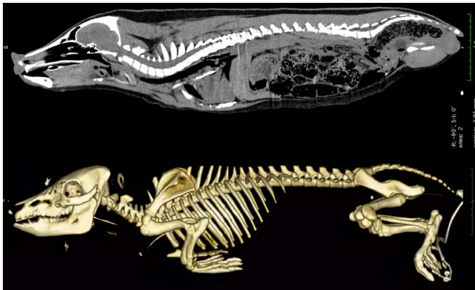
Picture 4 Full body CT scan of Göttingen Minipigs and CT scan of Göttingen Minipigs showing segmented bone structure.